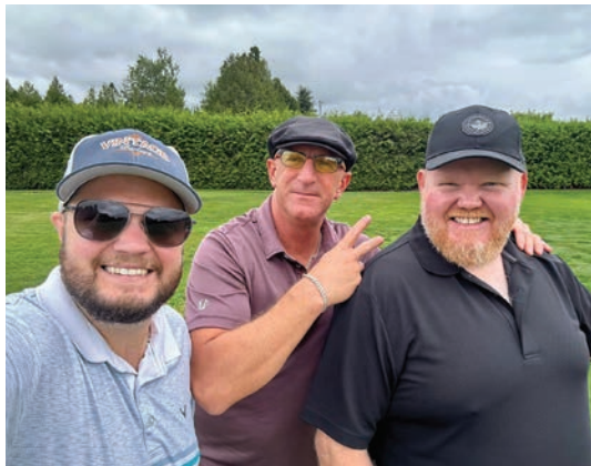
Fundraiser for Threshold House

Pray that we will be rooted in Christ and continue to share hope each day at Threshold House.